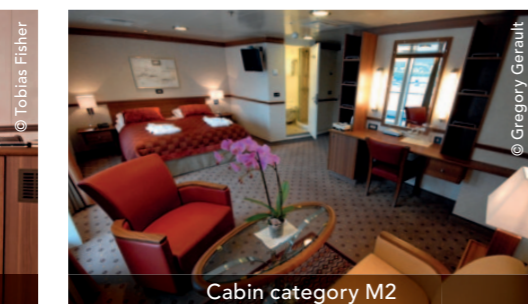
Cabin category M2