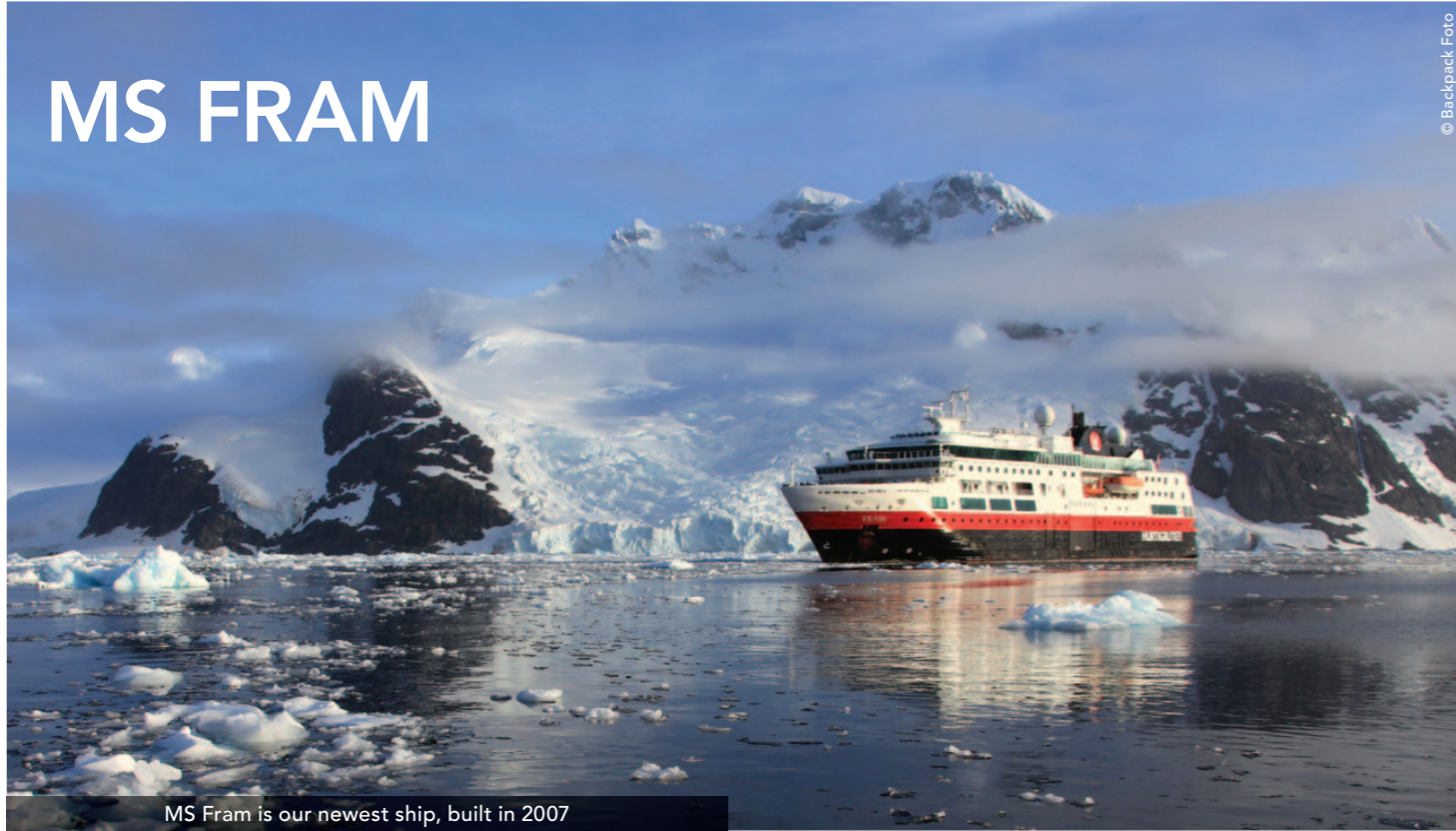
MS Fram is our newest ship, built in 2007